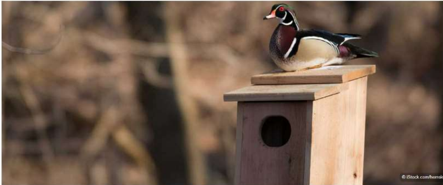
A Home for Wood Ducks and Others

These wooden structures help boost local wood duck populations, and may also be used by other cavity nesting birds.