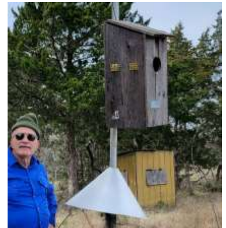
Wood Duck house approximately 3 years old and still functional