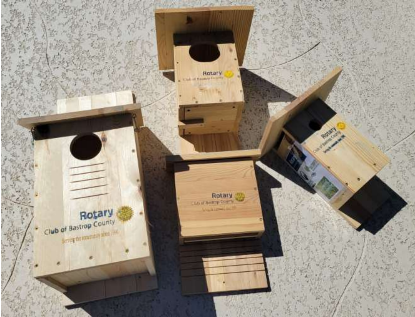
Native songbird (e.g., Bluebird), Wood Duck, Bat houses, Owl