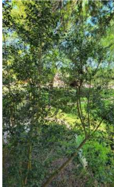
Examples of natural bird nests in bushes: Nests susceptible to severe weather (wind, rain), “Support God’s creatures” predators (e.g., squirrels, racoons, snakes, fire ants, etc.)