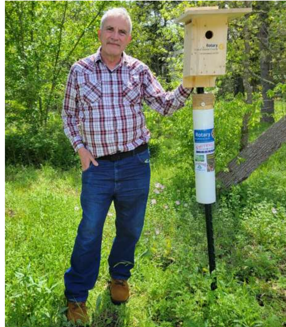
Native bird house with predator guard